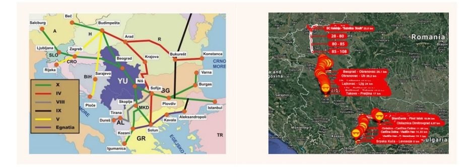
Fig. 3: Traffic Management

The main components of the traffic control system are: